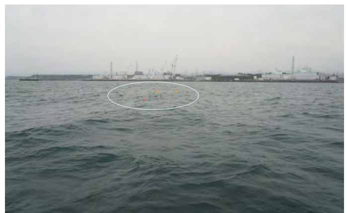
One kilometer along the coast of Fukushima Daiichi Nuclear Power Plant where 12 meters below the sea surface a tunnel was constructed to use for controlled discharge of the ALPS treated water (edited with highlight in photo). Fukushima, Japan. 5 July 2023 | Rafael Mariano Grossi visits Fukushima NPP (01815846)

The International Atomic Energy Agency (IAEA) has recently approved the discharge of nuclear waste water in the Pacific Ocean. However, the discharge, especially amid the growing impacts of the climate emergency, threatens the Common Home and exacerbates the vulnerability of communities that rely on the ocean for their lives and livelihood. The international community also raised concerns that the discharge is a direct violation of the provisions of the United Nations Convention on the Law of the Sea . Faith leaders and civil society unions in Japan and Korea continue to urge the Japanese government to explore alternative solutions to minimize ecological impact.