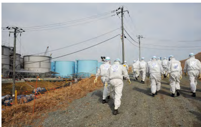
IAEA decommissioning team members walk past tanks that store contaminated water. Fukushima, Daiichi, 1 February 2015

On April 5, 2023, the Citizens' Radiation Protection Centre and the Environmental Movement Association released the "Japan Agricultural, Fisheries and Livestock Products Radioactive Pollution Analysis Report" that analyzed the radioactive substance test results. Radioactive contamination has been identified in 5.3% of aquatic products, and 29% of marine wildlife. Radioactively contaminated seafood is still being found in waters near Fukushima.